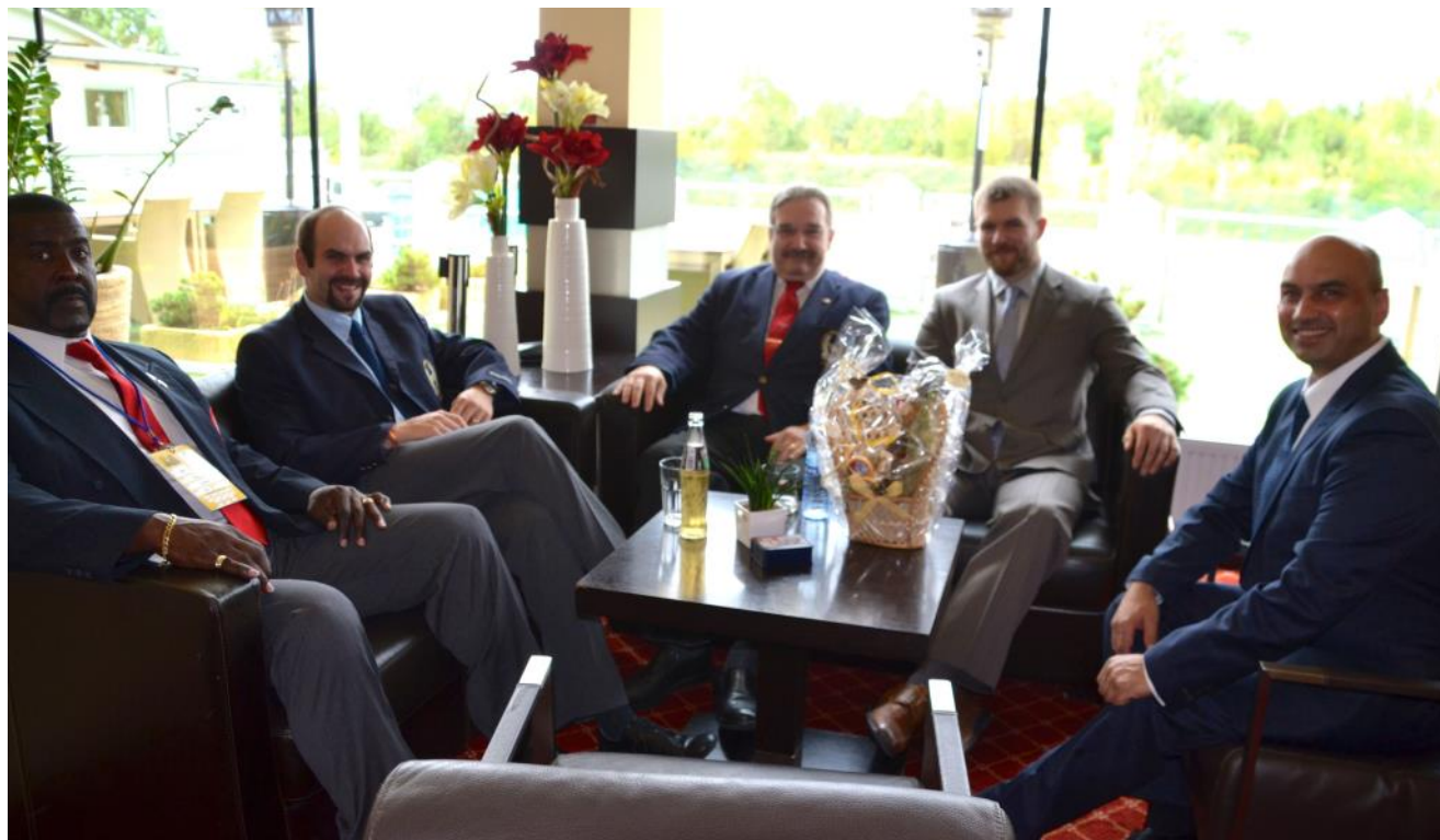
EC Members and SBD delegates in Pilsen after the signing of the agreement making SBD a new IPF VIP partner.